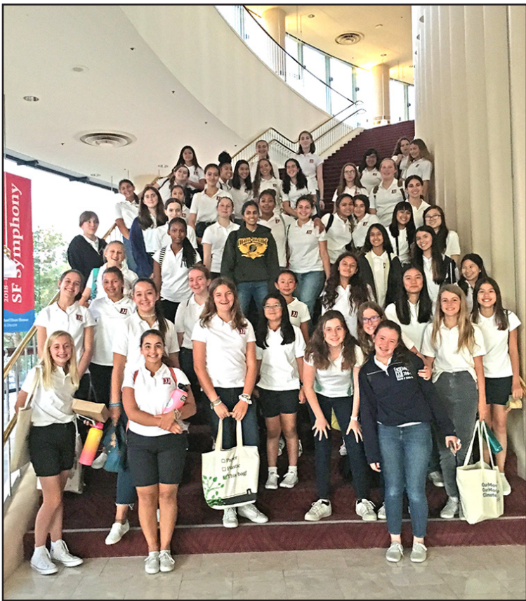
Members of Piedmont East Bay Children's Choir arrive at Davies Symphony Hall in San Francisco for a performance with the SF Choral Society.

The complexity of contemporary issues highlighted in Lang's piece served as perfect framing for