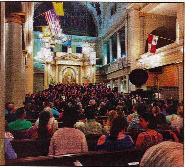
The Concert Choir performed before an audience of 700 people in New Orleans' historic St. Louis Cathedral for the Crescent City Choral Festival.