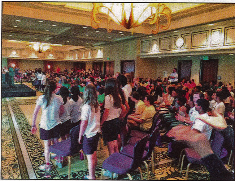
Members of Piedmont Choir's Concert Choir rehearse in their hotel in New Orleans.