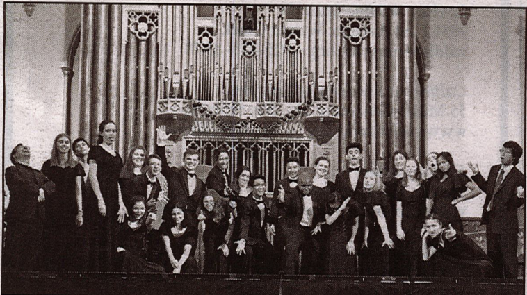
Ecco performs in the Assembly Hall in Salt Lake City's historic Temple Square.