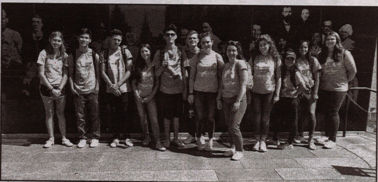
The Ecco group of Piedmont Choirs poses for a picture on their recent tour of Utah.