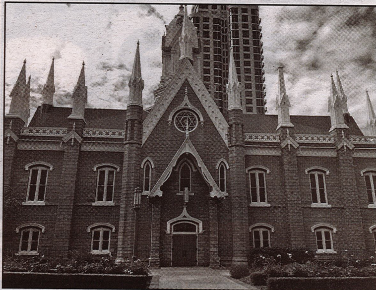
Piedmont Choirs' Ecco group performed in the historic Assembly Hall in Salt Lake City's Temple Square.