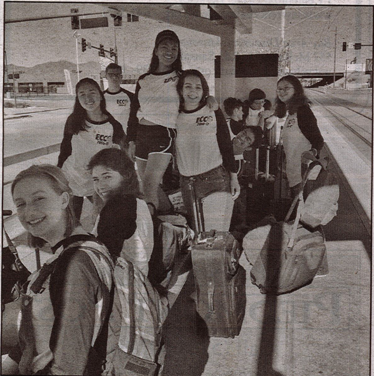
Members of Ecco wait for a train that will take them back to the cooler Bay Area.